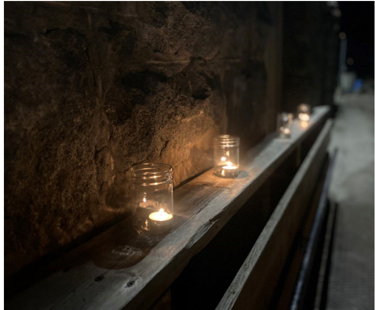
Setting the Mood